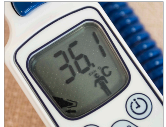
Infrared Thermometry LCD Screen