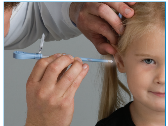
©2016 Bionix Development Corp. Patent Pending.