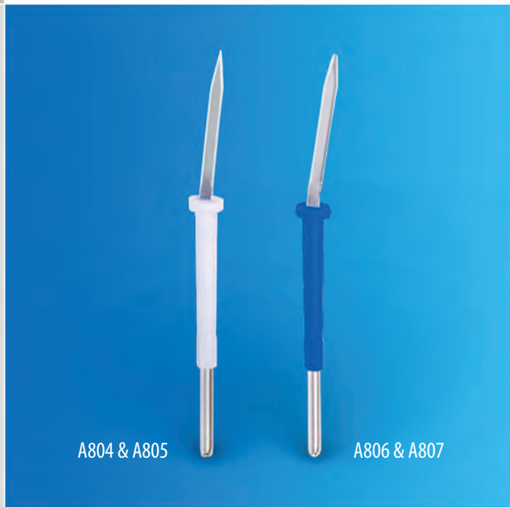
A804 &amp; A805