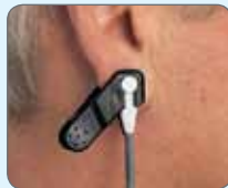
Use with SpO 2 sensor >30 kg