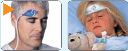
Adult/Pediatric >10 kg