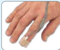
Multisite >1 kg