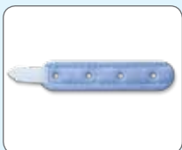
For OXI-P/I, OXI-A/N, D-YS