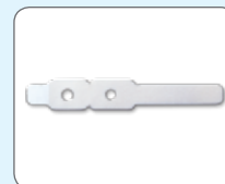
For OXI-P/I, D-YS