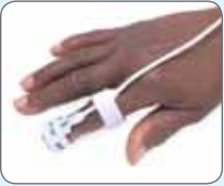
Adult >40 kg