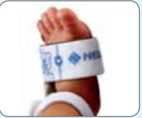
Preterm Infant <1.5 kg