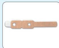
For OXI-P/I, D-YS