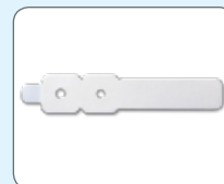
For OXI-A/N, D-YS