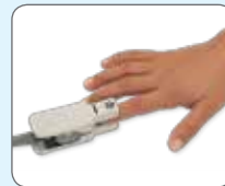
Use with SpO 2 sensor 3-40 kg