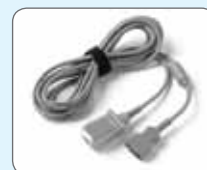
10' Patient Interface Cable

For pulse oximeters without OxiMax technology