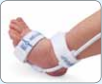
Neonatal 1.5-5 kg