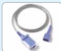
4' or 8' Sensor Extension Cable

For Nellcor™ pulse oximeters with and without OxiMax™ technology