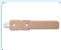
For OXI-A/N, D-YS