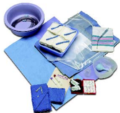
C-Section Deluxe Kit