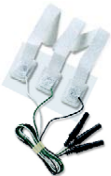
EP30018 Limb Band