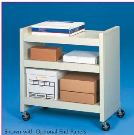
Shown with Optional End Panels