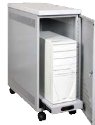
CPU Locker ™