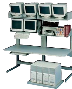
Technical Furniture Systems ™