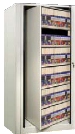
Ez2 ® Rotary Action File