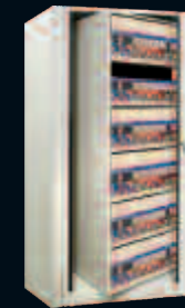
Ez2@ Rotary Action File