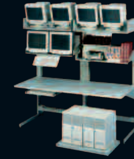
Technical Furniture Systems™