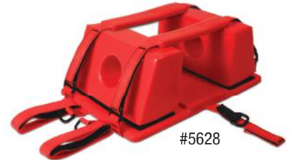
Deluxe Head Immobilizer