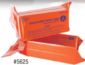
Disposable Head Logs