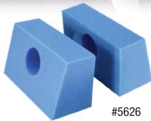
Disposable Foam Head Blocks