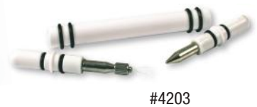
Eye Magnet with Loop