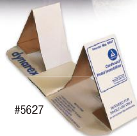
Cardboard Head Immobilizer