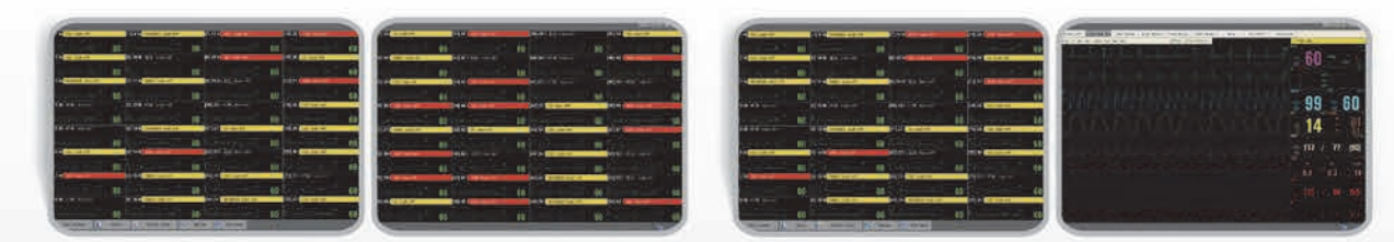
64 Beds Display Single Bed View