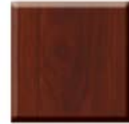
Cherry Mahogany (CM)