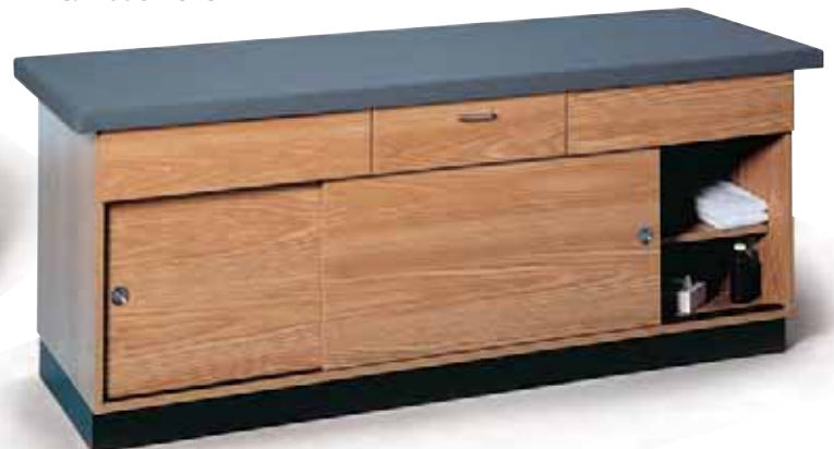
C. Model 4543