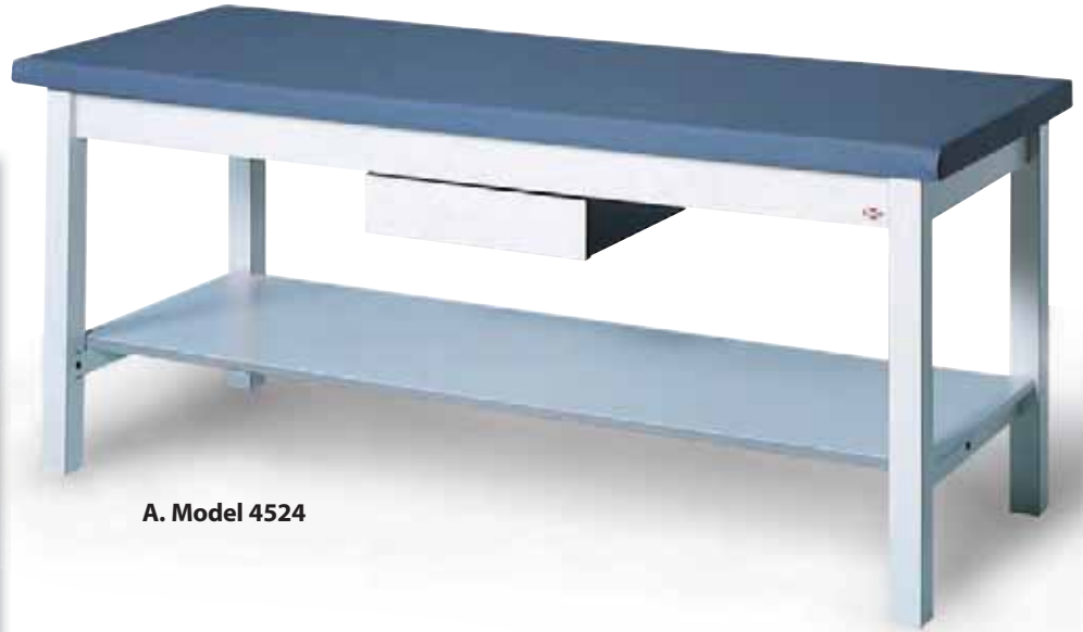
A. Model 4524