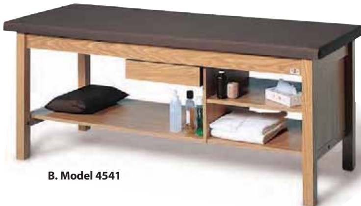
B. Model 4541