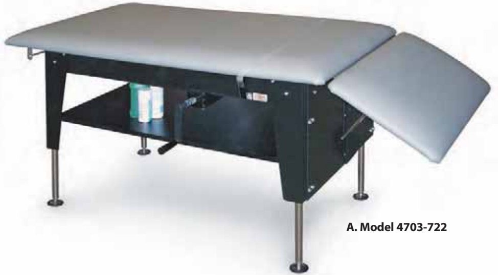
A. Model 4703-722