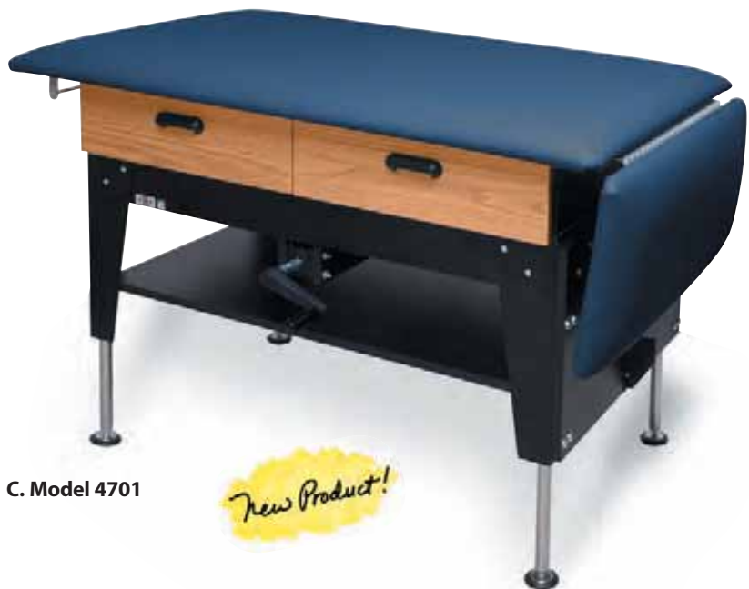
C. Model 4701