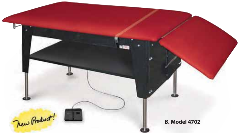
B. Model 4702