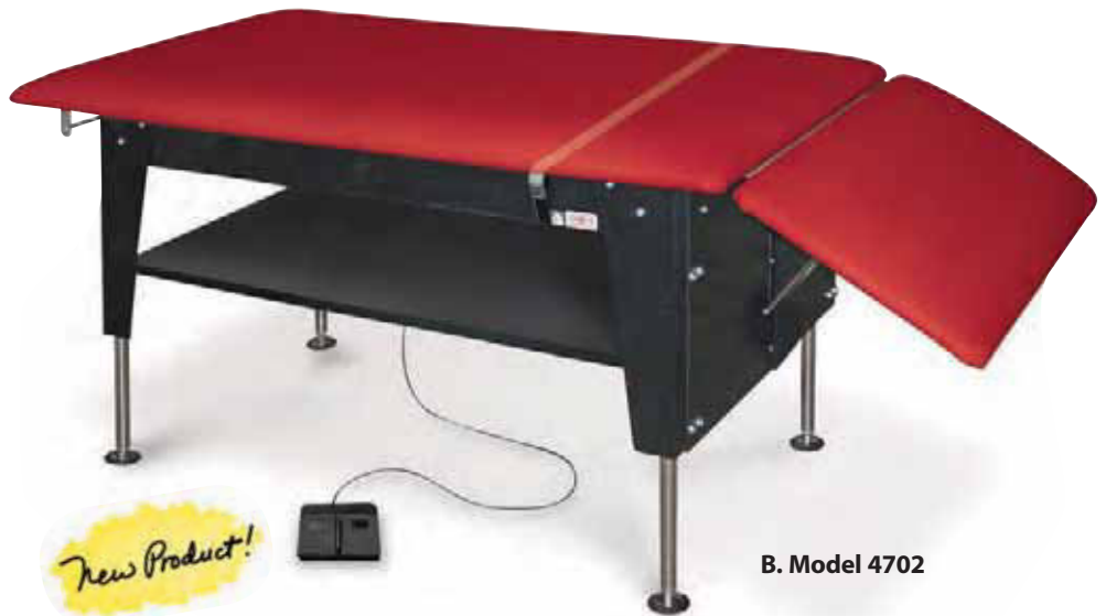
B. Model 4702