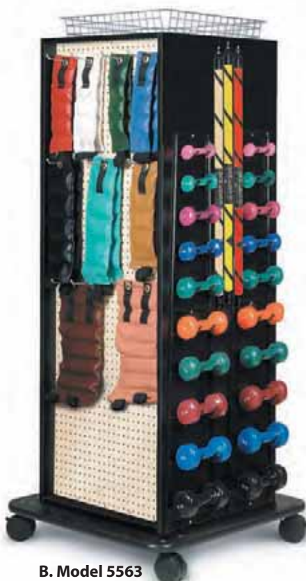
B. Model 5563 Front view

All weights and dumbbells shown must be ordered as accessories