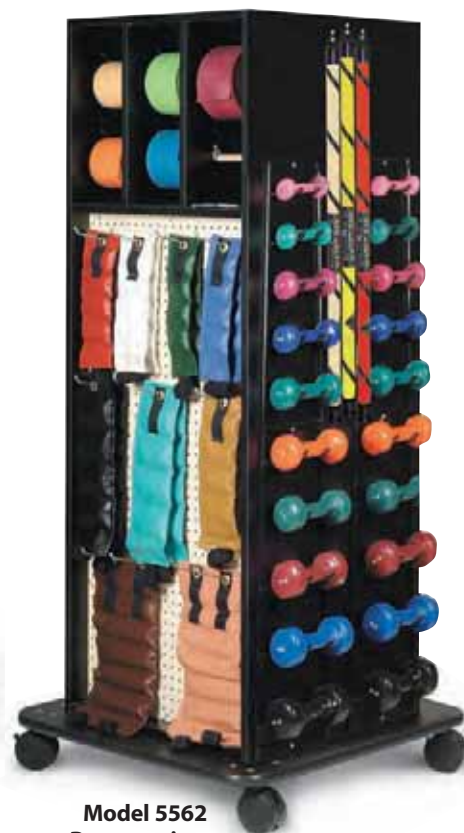
Model 5562 Reverse view

All weights and dumbbells shown must be ordered as accessories