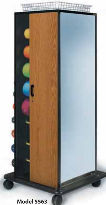
Model 5563 Reverse view