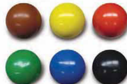
E. Model 5545