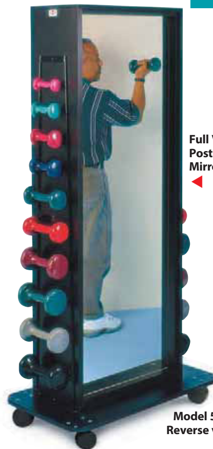
Full View Posture Mirror