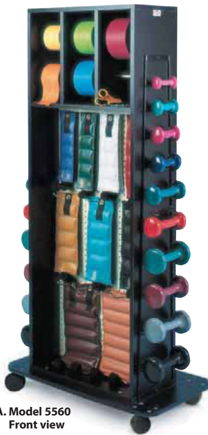
A. Model 5560 Front view

(REP Resistive Exercise Bands™ must be ordered as optional accessory. See page 50).