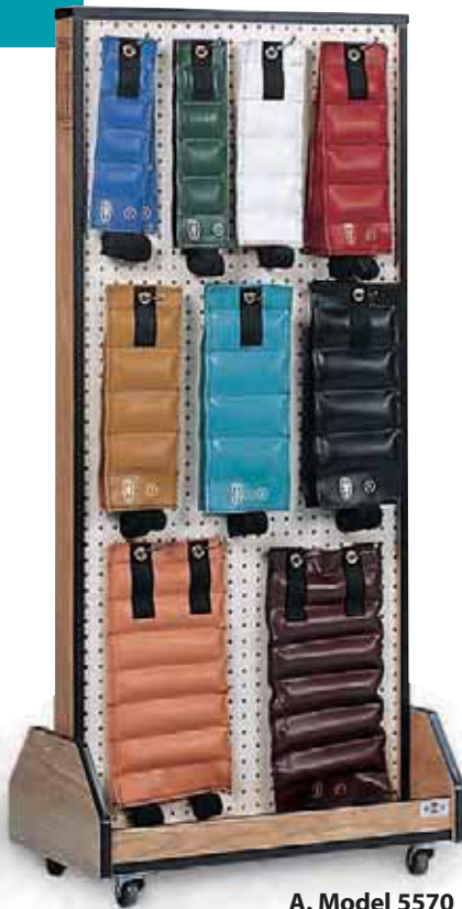
A. Model 5570