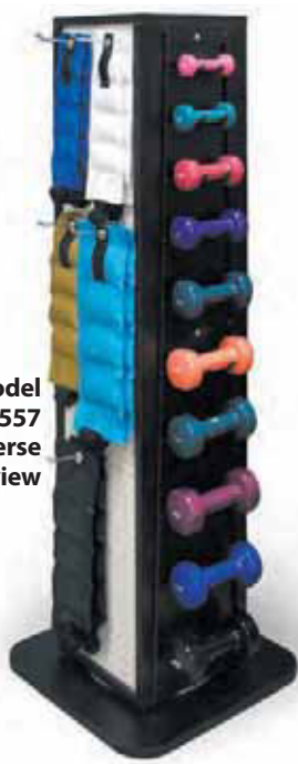
Model 5557 Reverse view