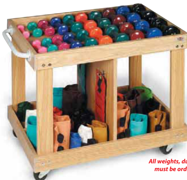
C. Model 5576

All weights, dumbbells and bands must be ordered as accessories.