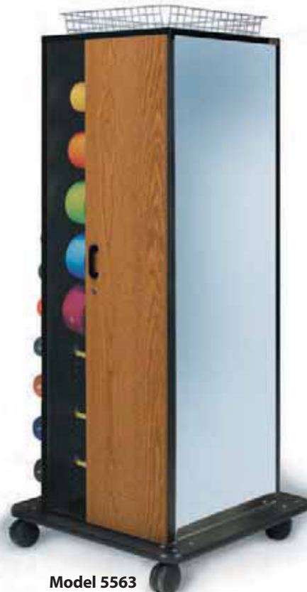
Model 5563 Reverse view