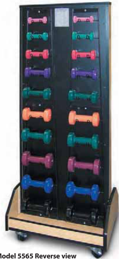
Model 5565 Reverse view

All weights and dumbbells shown must be ordered as accessories