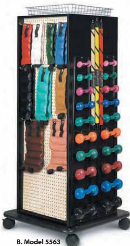
B. Model 5563 Front view

All weights and dumbbells shown must be ordered as accessories