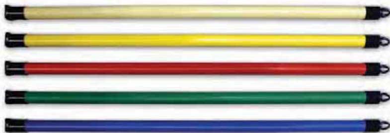
D. Model 5541