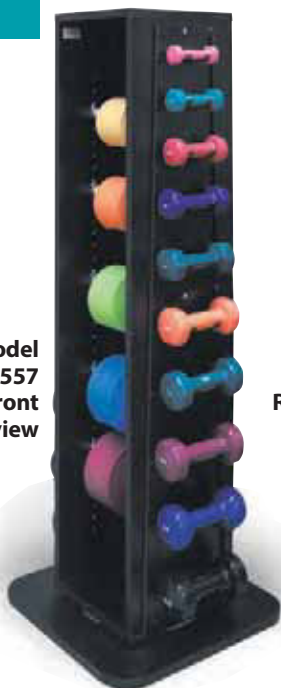
A. Model 5557 Front view