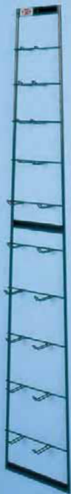
A. Model 5555