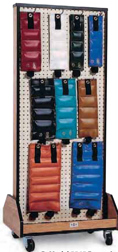
B. Model 5565 Front view