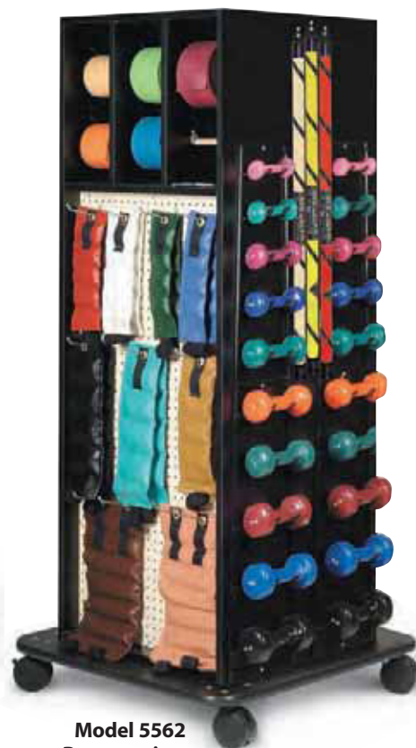
Model 5562 Reverse view

All weights and dumbbells shown must be ordered as accessories