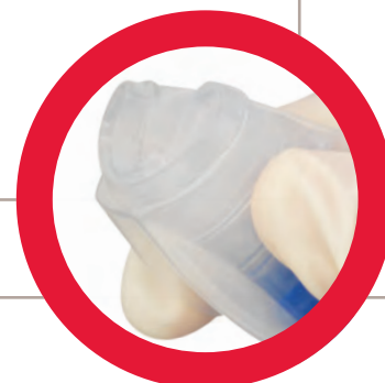
Sampling/Tube Flushing Port