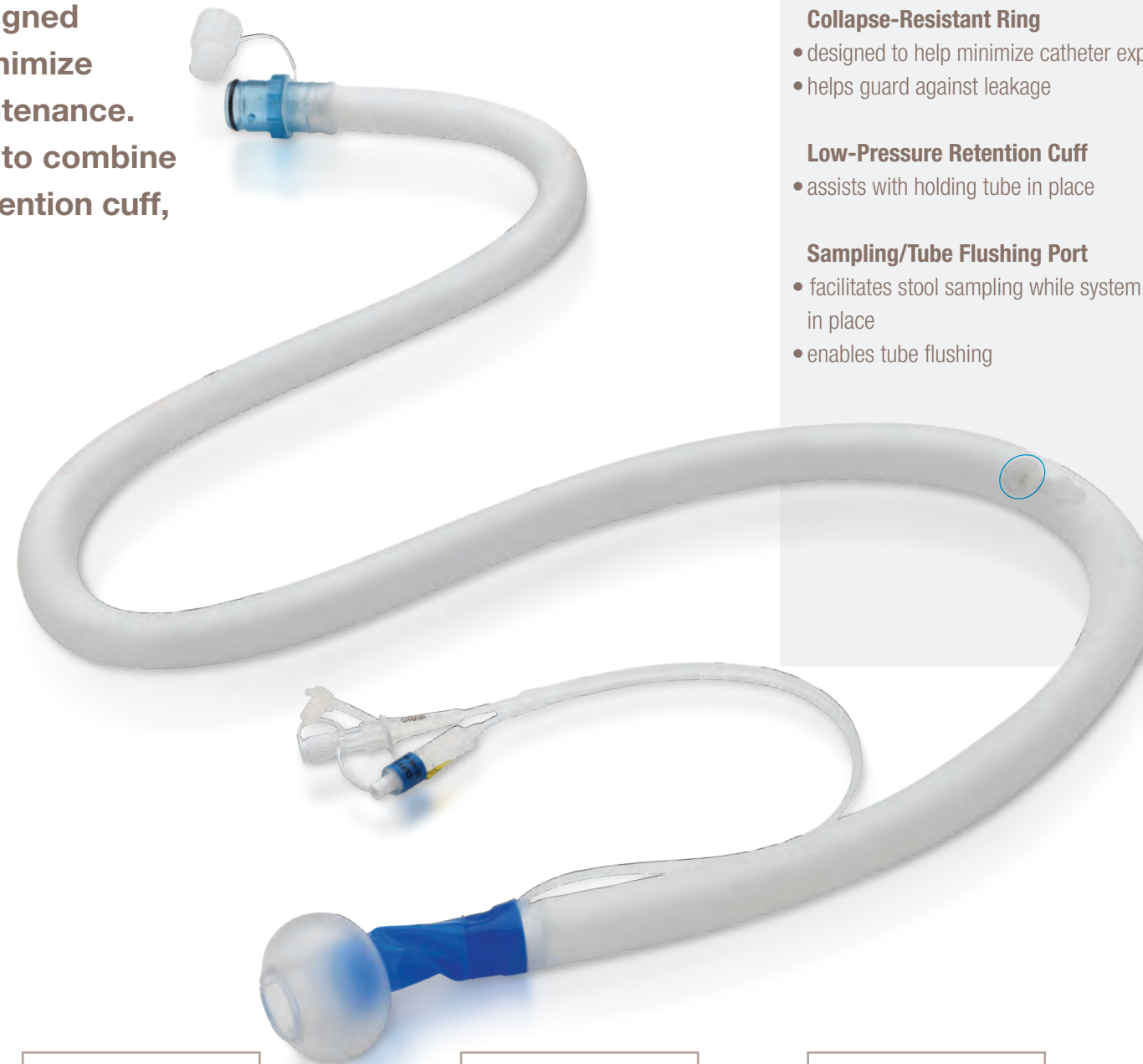
Collapse-Resistant Ring and Low-Pressure Cuff