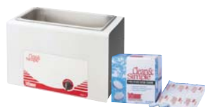
Clean & Simple™ Ultrasonic Cleaners and Tablets

Documents: date, time, temperature, pressure.