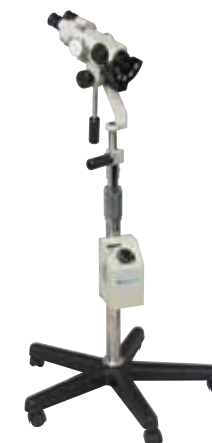
TriStar™ with Trulight™