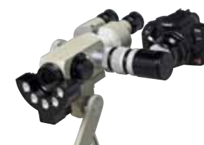
Digital SLR Camera and Adapter