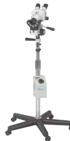
ZoomStar™ with Trulight™