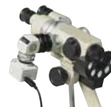
Digital USB Video Camera and Adapter