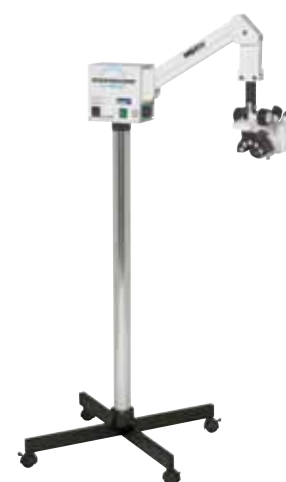
ZoomScope™ with Trulight™

Δ Available for Sale Where CE Mark is Required † Available for Sale in Canada