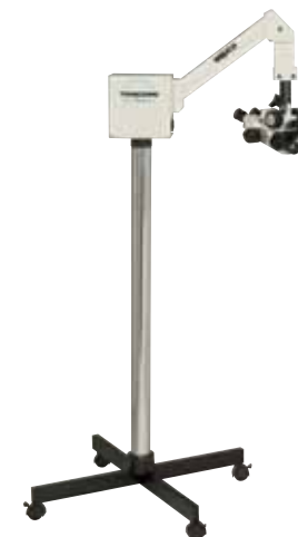
TriScope™ with Trulight™