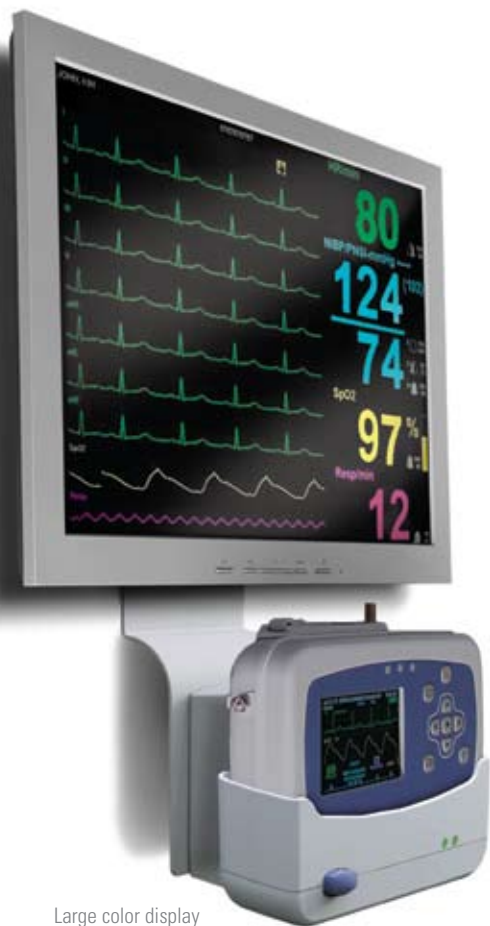
Large color display shown on wall mount.

Choose from 4- or 9-waveform display modes and easily see vital signs numerics, waveforms and alarm limits.